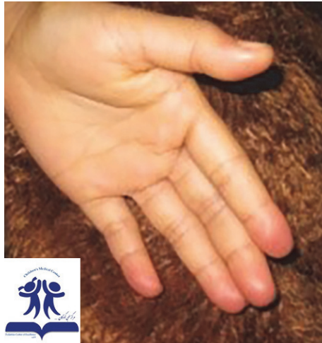
FIGURE 2: A 9-year-old girl with Nicolau syndrome after injection of benzathine penicillin in the deltoid muscle. Hyperemia and redness of the tips of the fingers of the left hand.

but there was some mild paresthesia in the route of the ulnar nerve of the affected limb. There was not any sign of compartment syndrome in the affected limb and a color Doppler ultrasonography revealed normal blood flow in the veins and arteries of the left upper limb. The examinations of the other systems were normal and the vital signs were stable. Complete blood cells (CBC), erythrocyte sediment rate, C-reactive protein levels, and coagulation profile tests were within normal ranges.