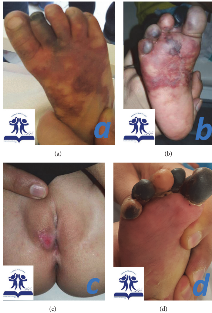
FIGURE 1: A 2-year-old girl with Nicolau syndrome after injection of benzathine penicillin. (a) The right leg and foot are pale and mottled with ecchymosis and the necrosis of the second toe. (b) Mottling and ecchymosis of the plantar surface and toes of the right foot and the necrotic toes. (c) A round ulcer with about 2-centimeter diameter, on the right labia majora. (d) At 2 months' follow-up improvement of the skin ecchymosis was noticed, but a persistent necrosis lesion in the distal phalanges of some of the toes appeared.

and the left was 95%. The right leg and foot were colder; however the pulses of the both lower limbs were symmetrical and normal on palpation. Complete blood cells (CBC), erythrocyte sediment rate, and C-reactive protein levels were within normal ranges. Aspartate aminotransferase, alanine aminotransferase (ALT), creatinine phosphokinase kinase (CPK), and lactate dehydrogenase had been increased about three times of normal but dropped to normal ranges in few days. Coagulation profile, rheumatologic tests, and color Doppler ultrasonography of lower limb arteries and veins were normal. The patient was prescribed nifedipine tablet 5 milligrams daily and Ibuprofen syrup every 8 hours. The genital ulcer was treated with daily dressing. During the admission, the patient's irritability improved and the mottled purple patches faded. The patient was discharged with the prescription of nifedipine tablet 5 milligrams daily, prednisolone tablet 2.5 milligrams three times a day, and Ibuprofen syrup 3.5 milliliters in case of pain. At 2 months' follow-up